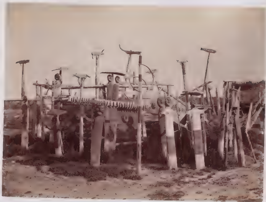
| 24. Esquimau Monuments.